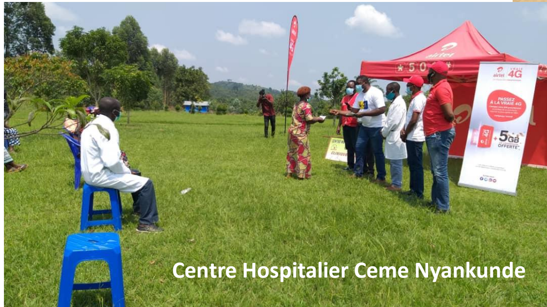
Centre Hospitalier Ceme Nyankunde