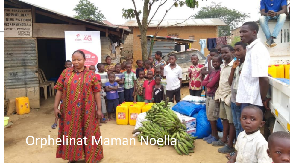
Orphelinat Maman Noella