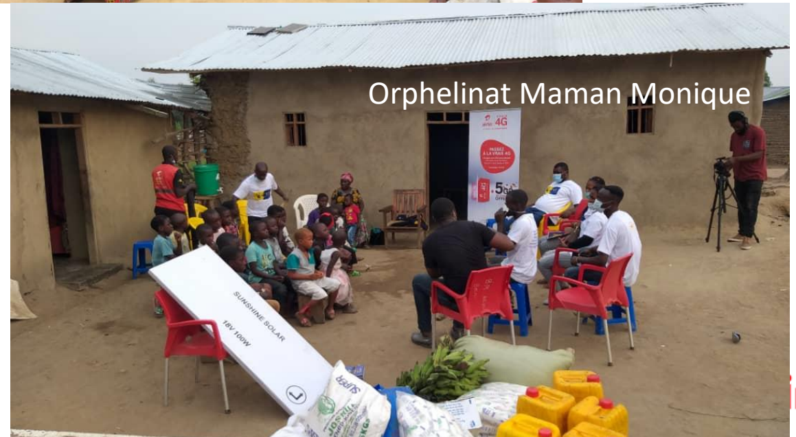
Orphelinat Maman Monique