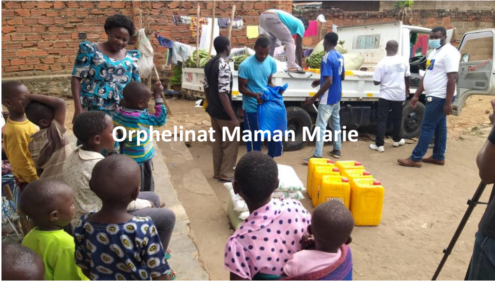
Orphelinat Maman Marie